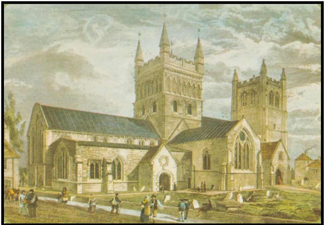
WIMBORNE MINSTER from an original colour print circa 1852

(Such an excursion from our old school in the early summer of 1948 must have proved an especially exciting expedition in a post-war world just beginning to recover from the horrors of war. Ed)