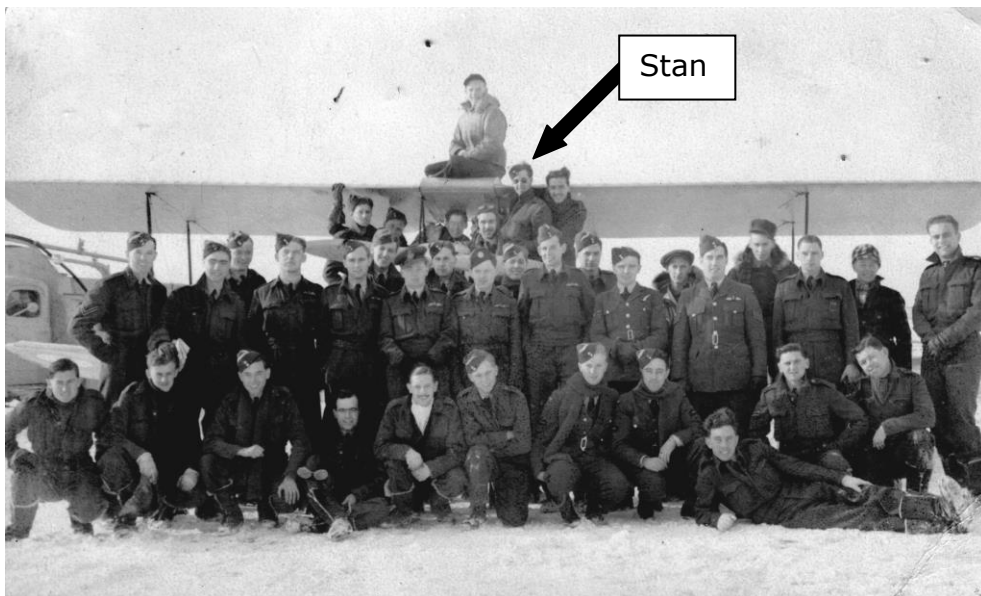
Believed to be at the Royal Canadian Air Force base at Carberry, Manitoba.