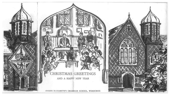
(Are the pictures not splendid? Congratulations, Pat!)