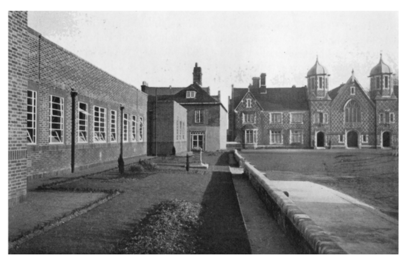
NEW BUILDING (Opened in December, 1936) MAIN BLOCK

How many hours did YOU spend sitting on this wall? happy days. A.B.