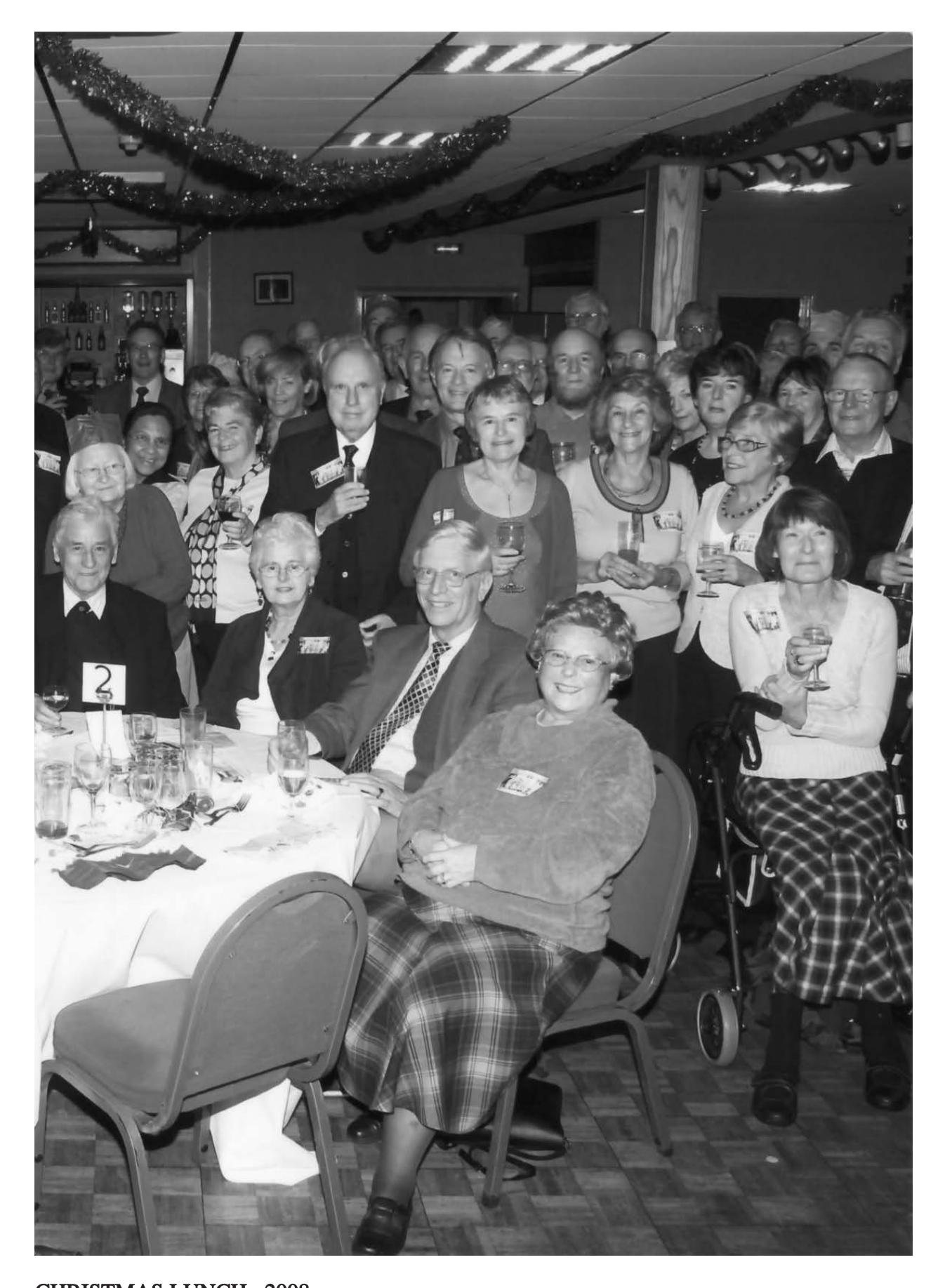
CHRISTMAS LUNCH , 2008

Originally published in the Editor's 'Dorset Journey'