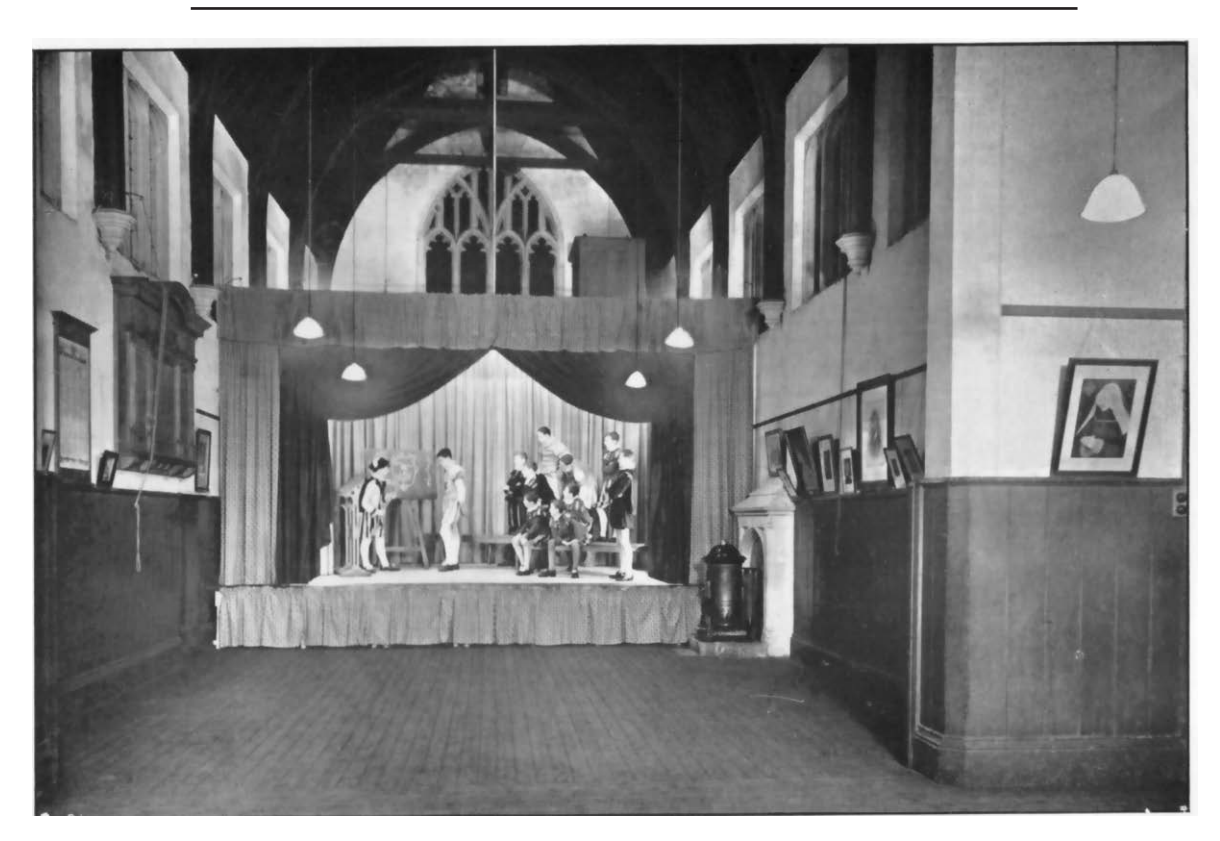
BIG SCHOOL (West End) (Where so many Winburnians first trod the boards)