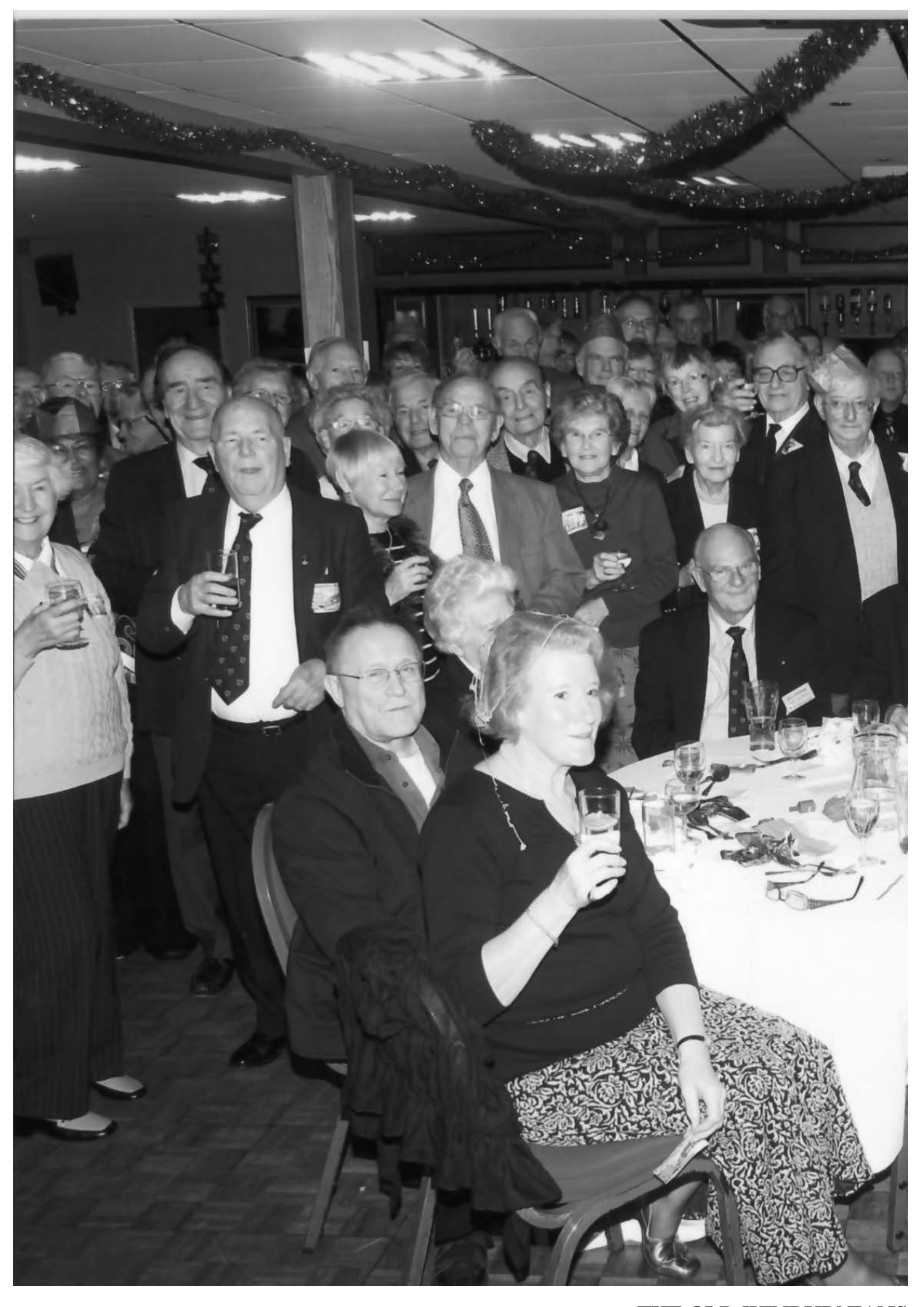
THE OLD WINBURNIANS