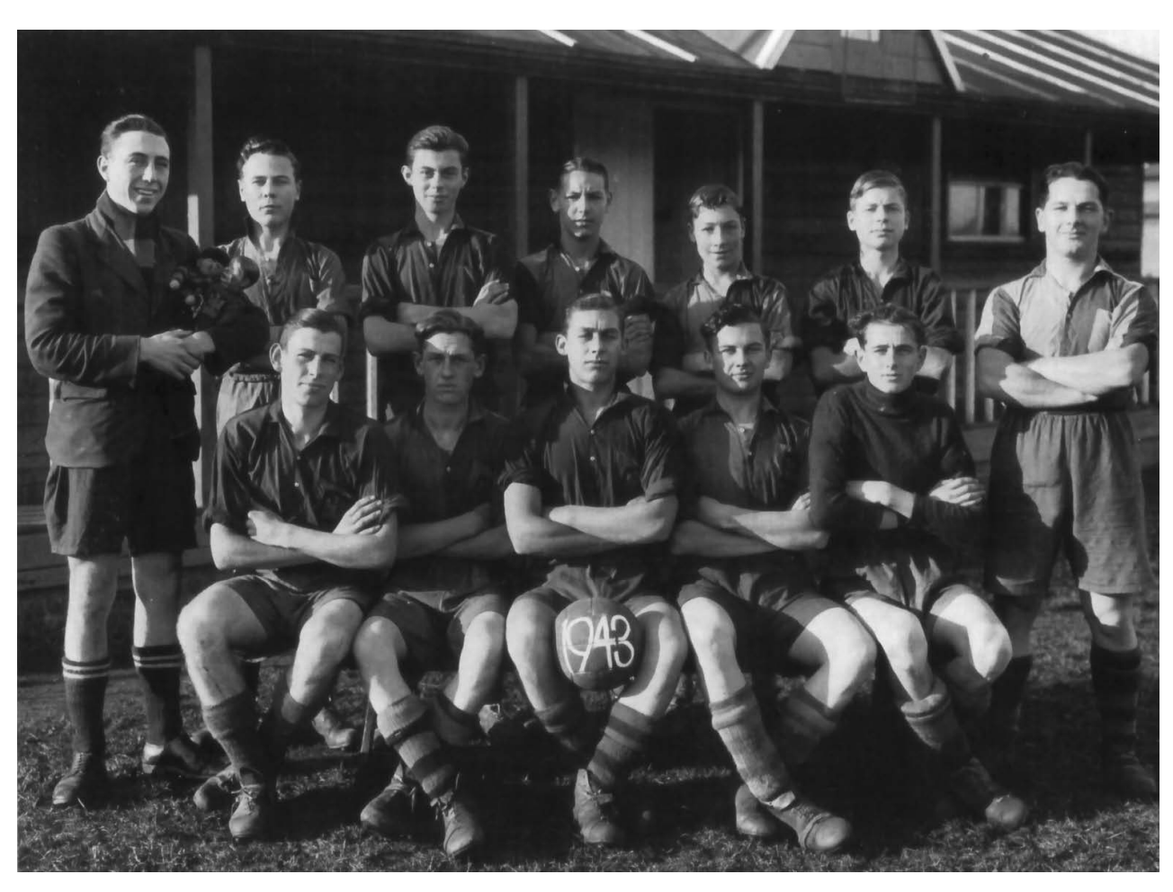
1st XI Soccer