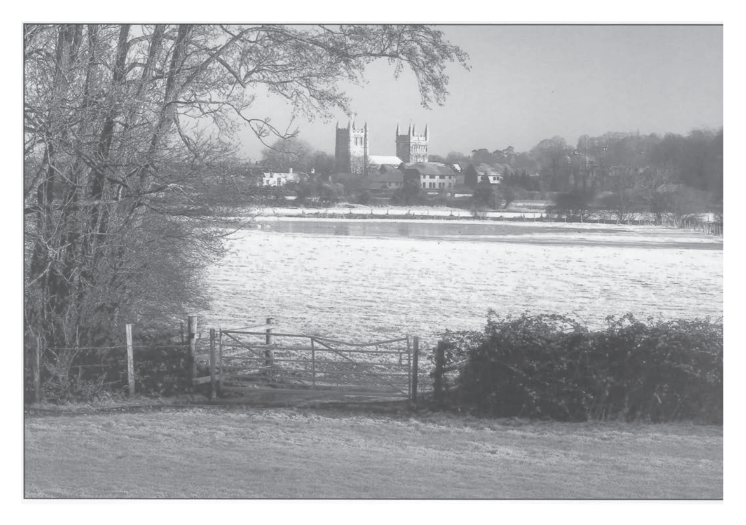
A winter's scene across the water meadows.