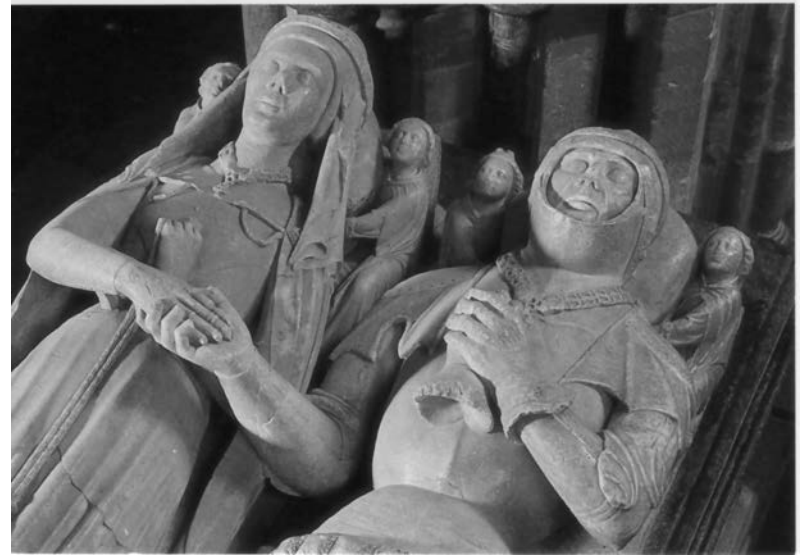
Wimborne Minster Above - Uvedale Tomb - Below - Beaufort Tomb

At the close of the service there will be a retiring collection for The Minster Funds.